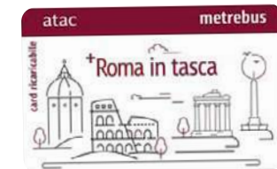
MULTIBIT €3.00 - €15.00