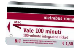
One-way ticket (BIT) € 1.50