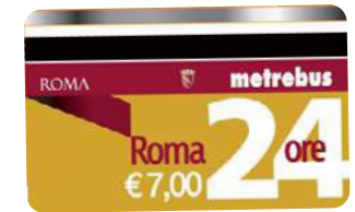
Metrebus 24 hours € 7.00