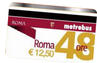
Metrebus 48 hours € 12.50