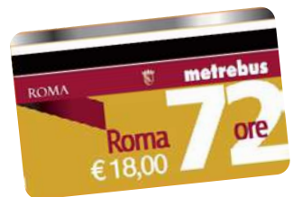
Metrebus 72 hours € 18.00