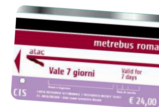
Weekly pass (CIS) € 24.00